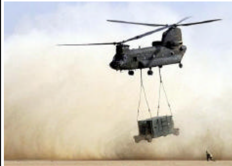
A CH-47 Chinook helicopter with the 101st Airborne Division takes off from Camp New Jersey in Kuwait 2003, carrying communications equipment to be flown into Iraq for the division's Assault Command Post.