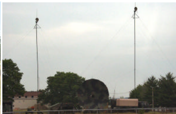
Co C 101 Sig Bn (Orangeburg) AN/TRC-173 Sending Signal Shots out from FT Devens, MA