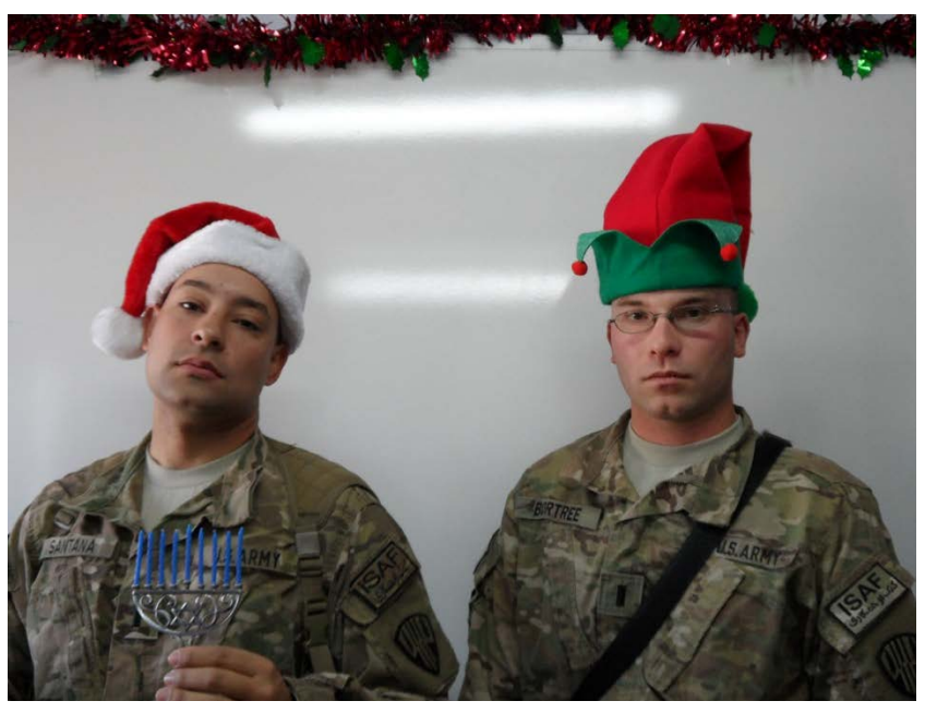
It's not that we don't like the holidays. We just don't like hats.

A CO 101 ESB CHARGERS Winter 2012-13 Issue 1