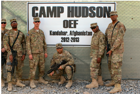
101 ESB Enterprise Operations Team